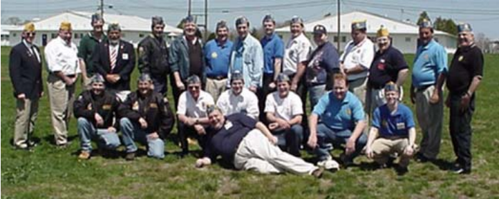
2004 Advanced Class at S.A.L. College