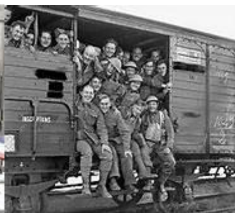
American Doughboys ready to move.