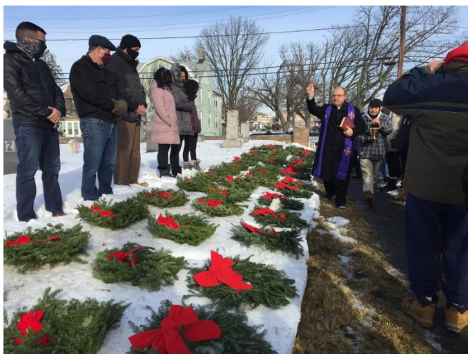
Blessing of the wreaths before Post and Squadron 105 members placed them at the graves of Veterans.

Also in January, a $500 donation by the SAL was made to the Fisher House Foundation. A matching donation brought the total to $1000.