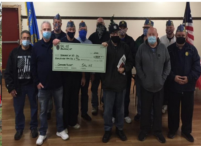
$355 plus additional $500 netted from 50/50, totaling $855 toward the Commander's Project.

A bugler from Belleville played taps following the reading of the honor roll.