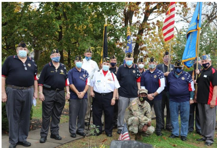
Veterans Day ceremonies at Belleville NJ Post 105.