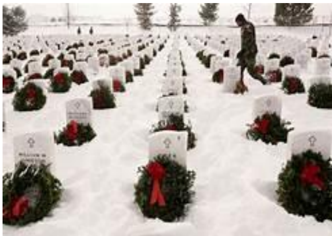
Wreaths Across American, Arlington in the snow.