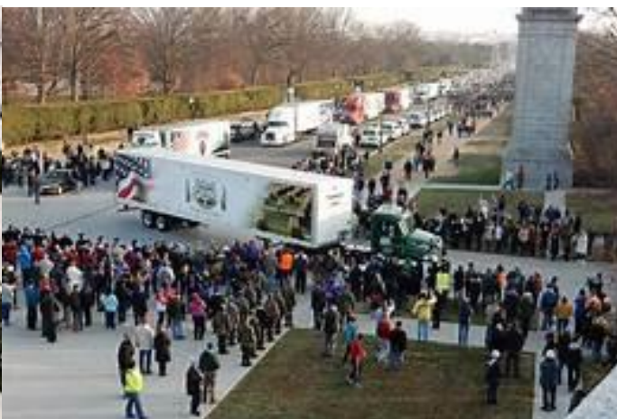
Truckloads of wreaths and so many volunteers to place them.