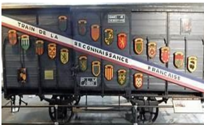
Decorated 40 & 8 box car.

Read the article on the next page about the Merci Trains and the 40 & 8 Society, once part of the Legion.