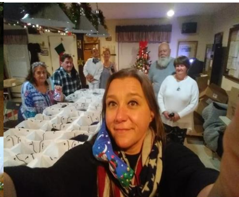
Post 311 Family packing gift bags

A little Christmas cheer was brought to Veterans Haven South by members of the American Legion Family. Spearheaded by Waterford Township Post 311 Family, Christmas dinner and gift bags were prepared, and delivered to the residents of Veterans Haven South on Christmas Day. There was even a special visit by Santa to greet some of the residents and help deliver food and gift bags. The gift bags were assembled with items donated that included cookies, candies, personal items, winter caps, ball caps and Wawa gift cards. The food was all home cooked and included ham, baked ziti, collard greens, corn bread stuffing, venison, and deserts. The following American Legion Families contributed to this great event: