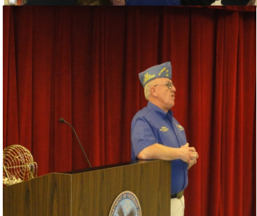
VA & R Bingo Party at East Orange VA Hospital