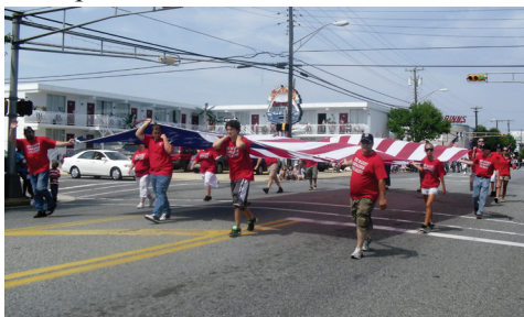
It's about supporting our armed forces always

Because so many officers and chairs have failed to write articles and send photos, I have been forced to assign them as appropriate. Good communication is vital for this organization and its members. I regret that articles in this this post-convention information edition issue do not include the Adjutant's Corner, Membership, and Son of the Year.