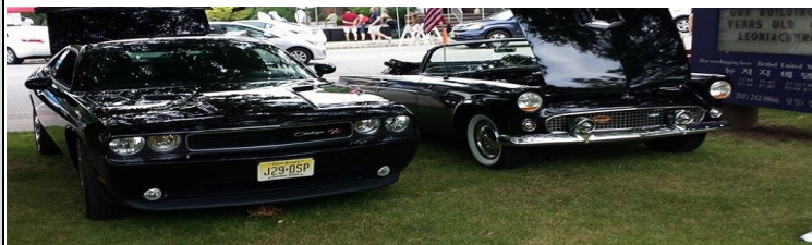
Car and Craft show at Post 310 Leona.