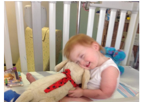
Words can not describe the joy and comfort provided by receiving a new friend like Josh.

The following week, and additional 30 Josh dogs found homes with children being cared for at the Jersey