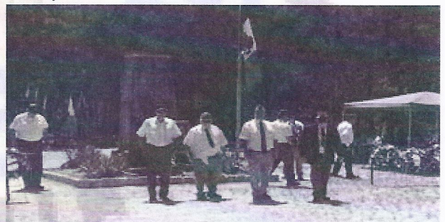
Carranza Service, Tabernacle

Be sure that the DD-214 eligibility papers showing service and discharge dates are in order then put them in your in a file. Remember that there are no social memberships in New Jersey. Do not give out membership cards to people who do not qualify just so they can drink at the canteen.