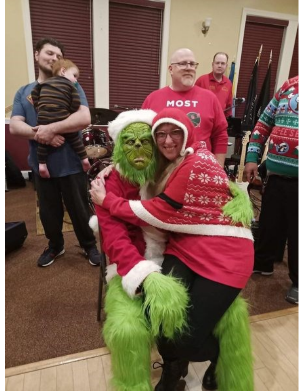
First came the (kinda creepy) Gingerbread Man, then the Grinch. Cindy Lou Who on his lap gives his identity away.