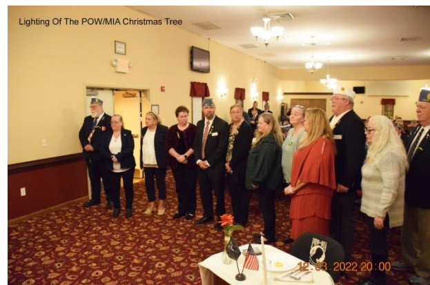
Lighting Of The POW/MIA Christmas Tree