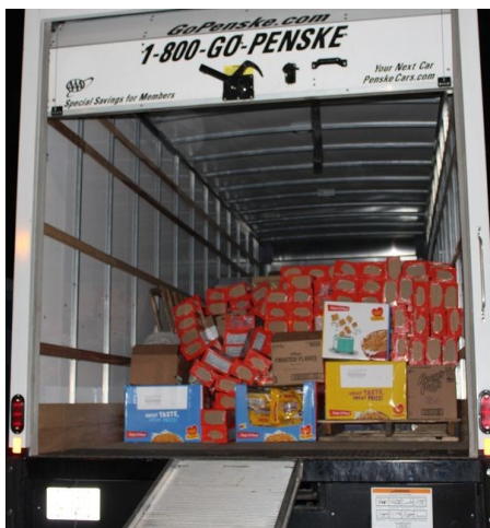
Loaded up and ready to go.