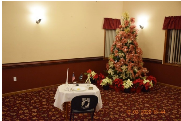
The POW/MIA Table and the Christmas Tree.