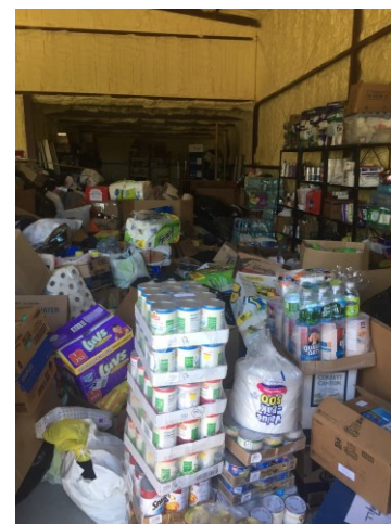
A few items in the warehouse.