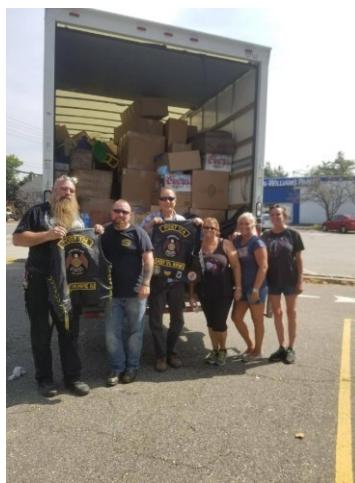
Post 174 Riders were there to help.