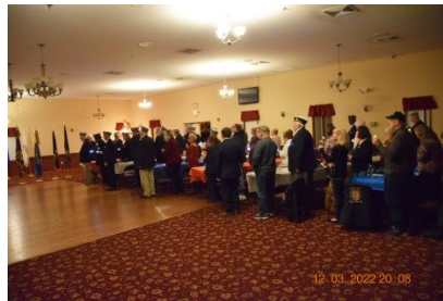
Some of the attendees.