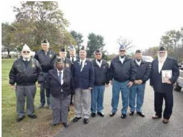
and gave the eulogy as the others stood Honor Guard for the ceremony.