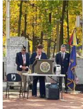
Pine Hill Post 286 at their Veterans Day Ceremony.