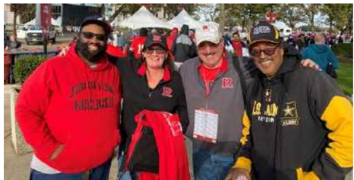
and SAL 266 Comdr) at SHI Stadium at Piscataway NJ on 7-Nov.