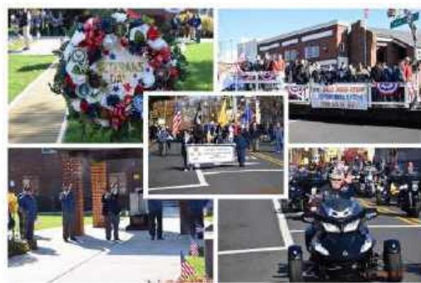
Toms River Post 129 Family in Toms River's Veterans Day Parade.