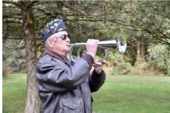
Hopewell Post 339 held their Veterans Day Service on 4-Nov.