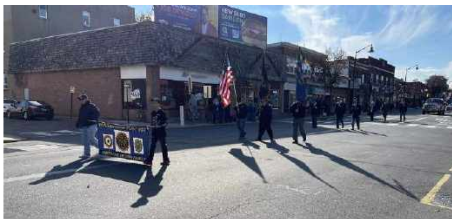
Woodbridge Post 87 Veterans Day Parade.