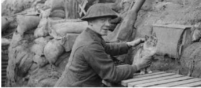
A gunner with the regimental cat in a trench in Cambrin, France, February 6th, 1918.