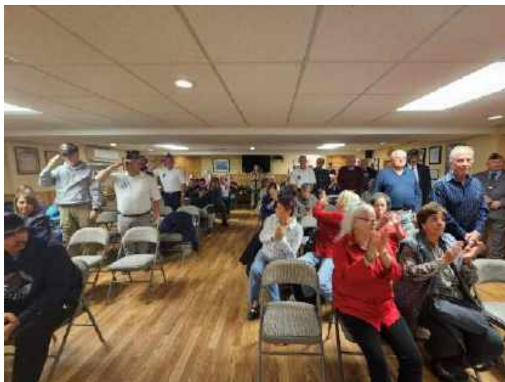
(Top) Totowa Post 227 on 10-Nov, indoor ceremony. "Will Our Veterans Please Stand." (Below) Totowa Veterans Day ceremony at Memorial Park on 11-Nov.