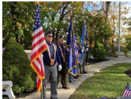
The 105 in the Belleville Parade and the ceremony that followed.