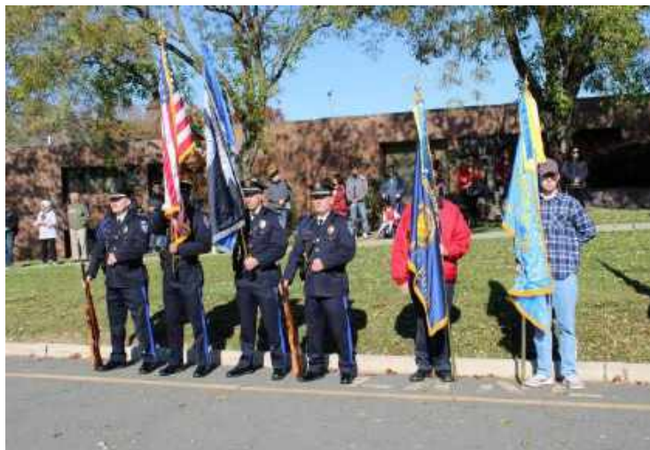
Monmouth Jct. Post 401 Ceremony at Municipal Complex in So. Brunswick

We look forward to your participation! American Legion Post 401, Veterans of Foreign Wars Post 7181, Dear Captain, Commander, American Legion Post 401