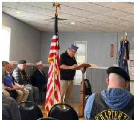
Veterans Day ceremony at Stetser-Lamartine Post 281 in Gloucester.